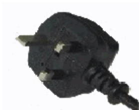
BS1363 13A plug